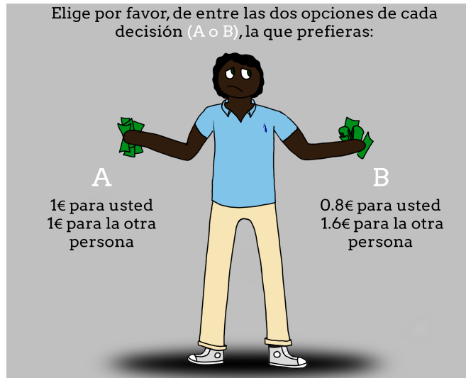
Figure 1: Dictator game: Decision screen (example)

Table 1 contains all the decision tasks with the dictator and recipient's payoffs, x_d and x_r respectively, for each option. We also include envy/compassion parameters (see section 4.1) and, in the last three columns, distributional effects and variation of the total surplus.